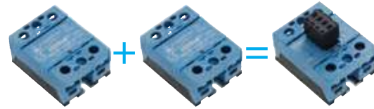
(Connectors to be ordered separately.)

Our two-phase range provides two solid state relays in a compact standard 45 mm enclosure. They are perfectly adapted to three phase applications with breaking of two phases only.