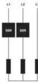
Two-phase SSR SOB to control heaters connected in star (for balanced low voltage loads without neutral connection)