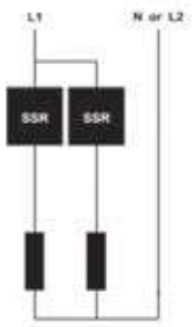
2 load control wiring Single phase